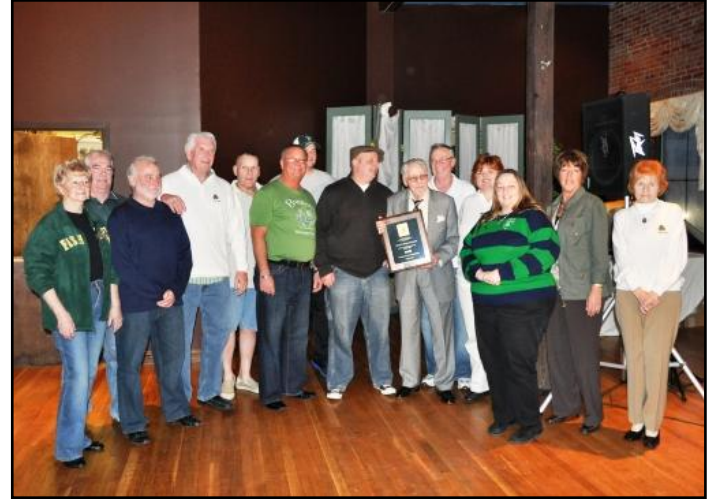
Members of Division 51 receiving the 2011 Joe Montgomery Award