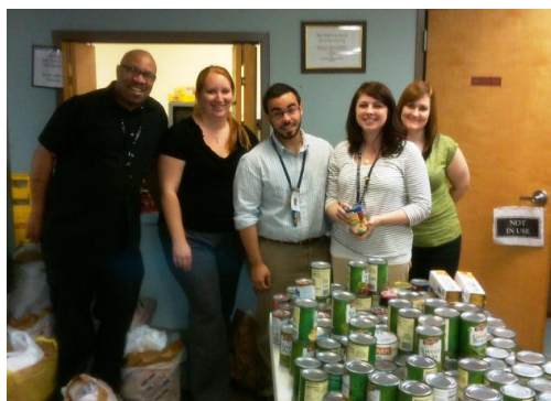
Veterans Center Staff-members sorting the canned goods collected